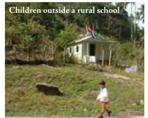
Children outside a rural school