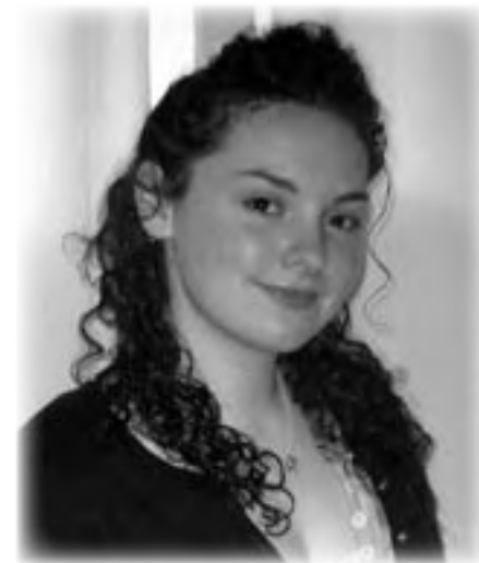
Directors of the Mood Disorders Association of Ontario.

I believe that individuals with mood disorders have inadequate access to education regarding their disorder and they are unfairly stigmatized. I am the youngest member to sit on the Board of