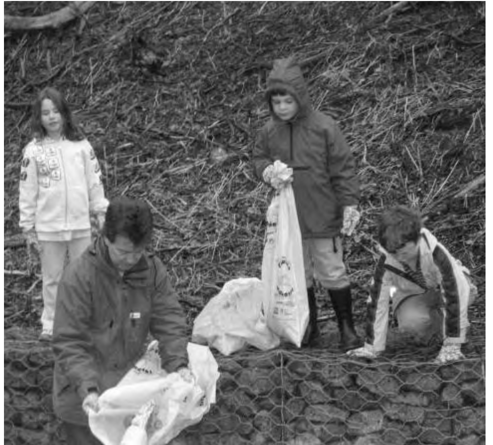
The troops hard at work in Burke Brooke at Sylvan Valley Way